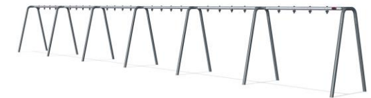
Portal Swing Frame Combination